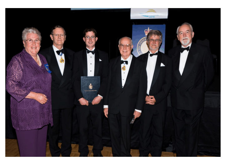
The Board of the Foundation