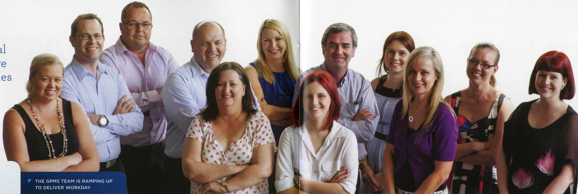
THE GPMS TEAM IS RAMPING UP TO DELIVER WORKDAY

As a leading multi-national organisation, it's critical we keep pace with technologies that drive efficiencies and strengthen our global competitiveness.