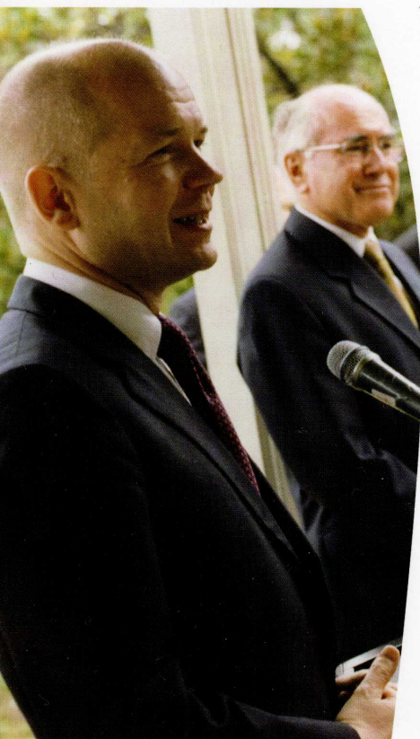
William Hague addressing a reception for IDU delegates at Kirribilli House

The Liberal Party continues to value greatly its links with like-minded parties throughout the world through membership of the International Democrat Union and the Asia Pacific Democrat Union.