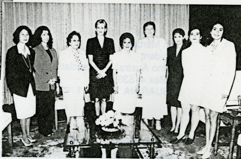
The NT Ladies Delegation meeting with the First Lady, Amelita Ramos at Malacanang Palace