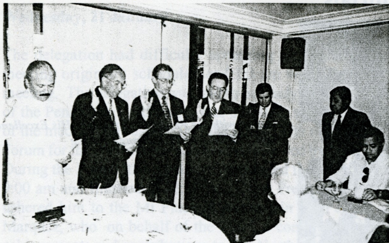
Minister Daryl Manzie being inducted as a member of the Phil. Australia Business Council (PABC)