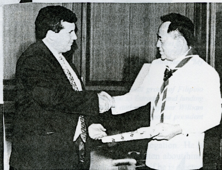
The Chief Minister Shane Stone with the Speaker Jose de Venecia in the Congress, Q.C.