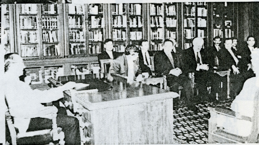
The NT Delegation meeting with the Phil. President Fidel V. Ramos at the Rizal Room, Malacanang