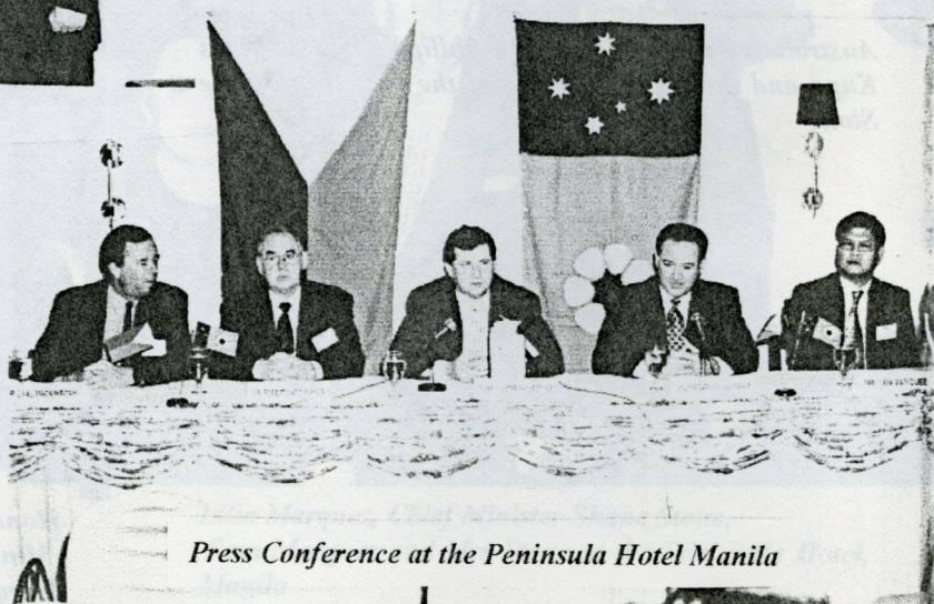
Press Conference at the Peninsula Hotel Manila