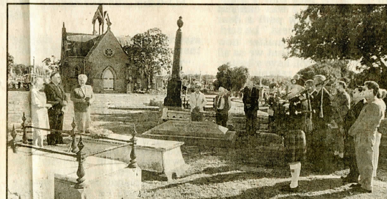
A CEREMONY in Bendigo yesterday remembered Federation's poet.

And be one people, mighty, serving God!"